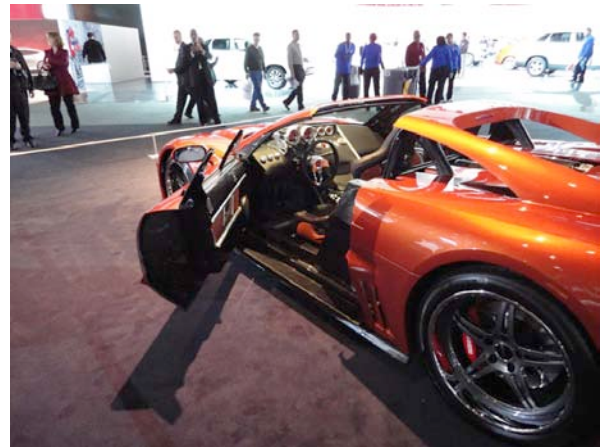
Holly, Michigan-based, Falcon Motorsports F7 Supercar.

Visit ControlsService.com for the full slide show from the supplier preview of the NAIAS