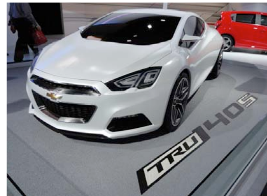
Clockwise from top left: BMW i8 Concept, Dodge Challenger SRT8, Lexus LF-LC, Chevy TRU-140S, VW E-Bugster Concept Full-slide show on controlsservice.com

This year's show includes many great looking concept cars. One of the standouts, for me at least, in the concept car department was the Chevrolet Miray (pronounced ME-Ray). Think Chevrolet Volt idea but with sporty styling and supreme performance. This concept car is a mid-electric, hybrid-powered sports car with a